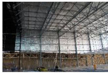
Fiber with foil Over Purlin Casino