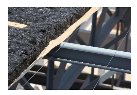
Fiber Over Purlin Suspended on Wires Airport