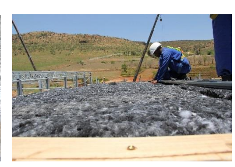
Fiber on Wires Studio